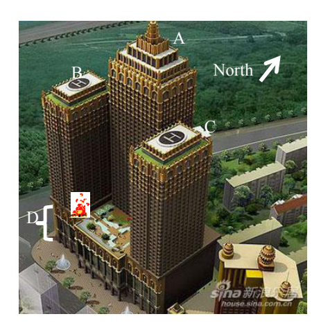
Fig. 3. The Wanxin Complex buildings.

Newly constructed and put in use in 2009, the Wanxin Complex comprises four individual parts, three towers and a skirt building interconnecting the three towers at the base, shown in Fig. 3. The skirt building is labeled as D, which is 10-storey or 46.8 m high over the ground and 3-storey underground. Above Skirt D, sitting three towers, labeled as A, B and C. Tower A is 45-storey or 180 m high and the rooms are used as a hotel. Tower B and C are both 37-storey or 140 m high. Tower B was occupied as an apartment building while Tower C was used as an office building. The horizontal distances between tower A and B, and A and C are both 6.5 m, while the distance between B and C are 63 m.